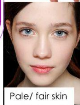
Pale/ fair skin