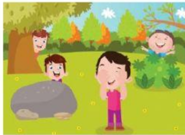
Hide and Seek