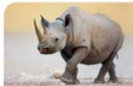
5. a rhinoceros 43 kph