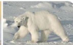
6. a polar bear 43 kph