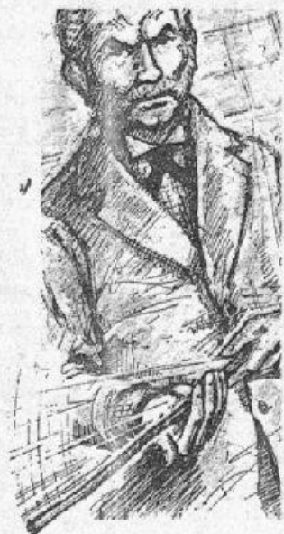
The teacher took his stick...

Finn was worse, much worse! The teacher took his stick, and two minutes later Tom's trousers were very hot and the teacher's arm was very tired.