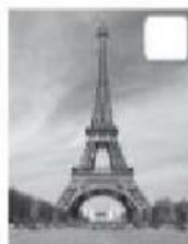
The Eiffel Tower