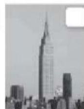
The Empire State Building