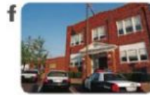
at a police station