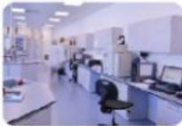
at a laboratory