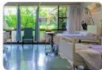
at a hospital