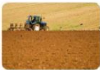
on a farm