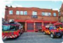
at a fire station