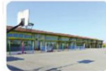
at a school