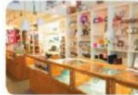
at a store