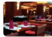
at a restaurant