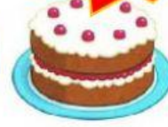
a cake kek