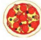
a pizza pizza