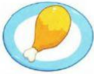
a chicken ayam goreng