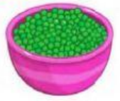
peas kacang hijau

Write a correct sentence. Tuliskan ayat yang betul