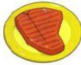
a steak daging panggang