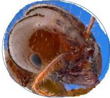
ant under hand lens