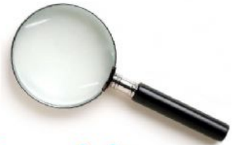
hand lens (magnifying glass)