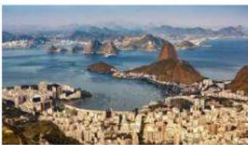
HARBOUR OF RIO DE JANEIRO