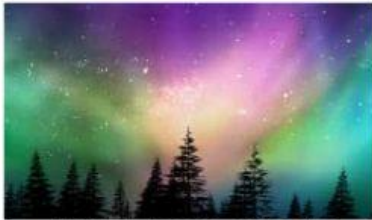
THE NORTHERN LIGHTS/AURORA

Instructions: Drag and drop the pictures in the correct box.