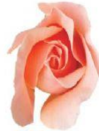
Hybrid teas are the world's most popular variety of rose.

Two of the most popular types of rose plants are the hybrid tea and the floribunda. As cut flowers, they sell in large numbers around the world, and the plants are also commonly grown in people's gardens. While similar in appearance, the two flowers have a number of differences. The hybrid tea has large, single flowers on each stem, whereas floribundas produce groups of smaller flowers on a single stem. The hybrid tea plant is also taller than the floribunda. Hybrid teas can grow to more than two meters in height, but the floribunda rarely grows higher than one meter.