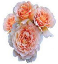
The flowers of a floribunda rose plant