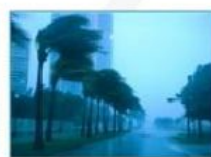
It's windy .