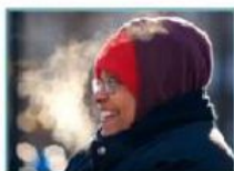
It's cold .