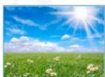
It's sunny .