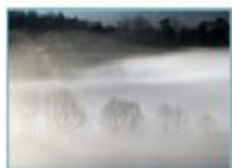
It's foggy .