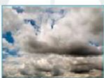
It's cloudy .