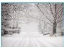
It's snowing .