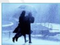
It's rainy .