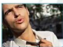
It's hot .