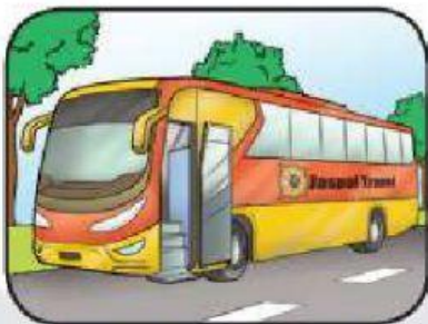
take – tourists – bus