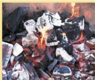
used charcoal to cook