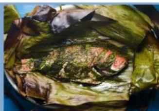
used banana leaves to wrap fish