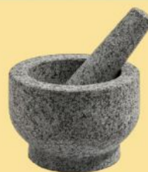
used a pestle and mortar to pound the spices