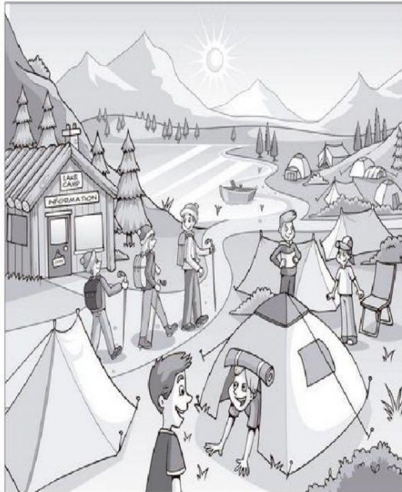
The vacation camp