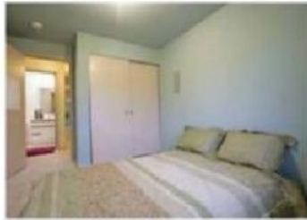
bedroom / hall