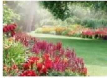
bathroom / garden