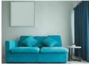
living room / hall