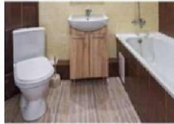
living room / bathroom