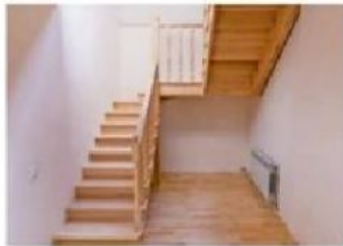
bedroom / hall