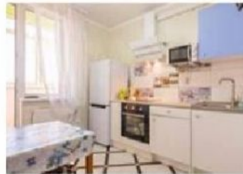
kitchen / bathroom