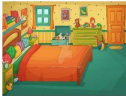
Bedroom: phòng ngủ