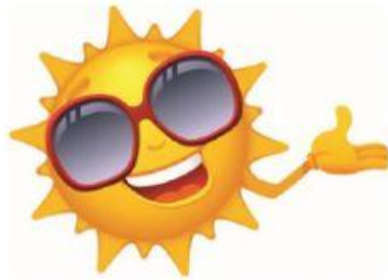
Summer; mùa hè