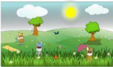
Spring: mùa xuân

I live in Vietnam and the weather is very different between the north and the south, there are 4 seasons in the north they are spring , summer , autumn and winter but in the south there are two seasons which are dry season and rainy season. I live in the north and it is summer so the weather is very hot I stay at home and turn on the fan and air-conditioner all day but I like summer.