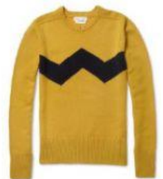
Sweater: áo len