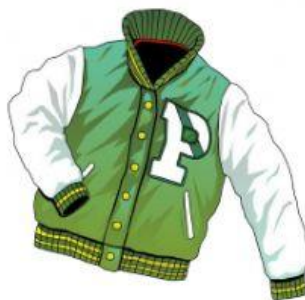
Jacket: áo khoác