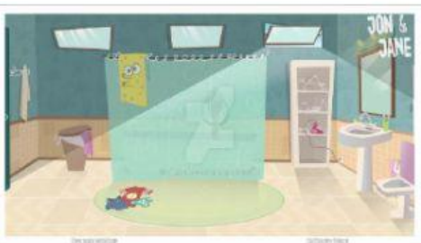
Bathroom: phòng tắm