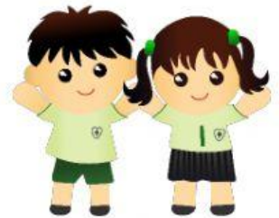
Uniform: đồng phục