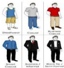
Casual clothes: quần áo bình

What clothes do you often wear ? when I stay at home I often wear casual clothes such as shorts, tank-top and T-shirt but I will wear uniform, pants and jeans when I go to school so I can look more smart and formal . When the weather gets cooler in the winter I will wear jacket, coat, sweater and shoes so I can keep my body warm. My favorite clothes are short and T-shirt because i feel comfortable when I play football.