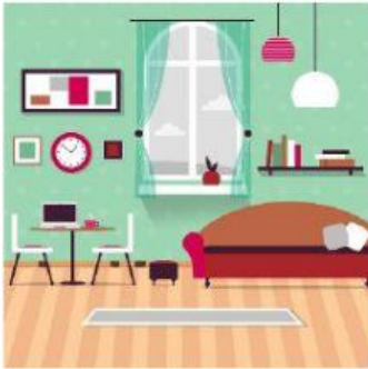
Living room: phòng khách

I live In a house with my family, my house has 5 rooms. There is a living room , 2 bedrooms , 1 kitchen and a bathroom . The room I like most is living room because my family can watch TV and chit-chat together it is really interesting . I live in the countryside so the air is very fresh and I can play many traditional games with my friends I really love this place.