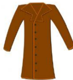
Coat: áo choàng