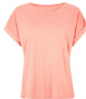
She needs to wear short sleeves.