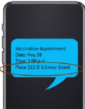
She needs the address.