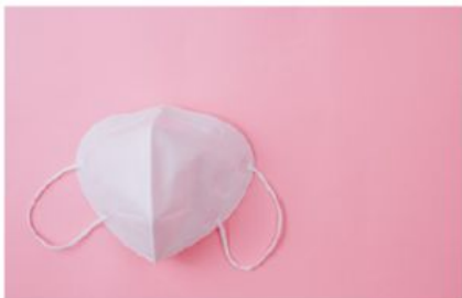
She needs a mask.