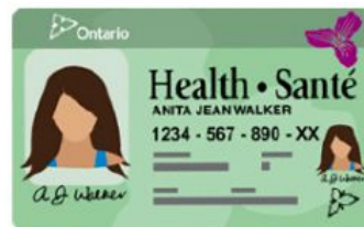
She needs her health card.