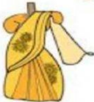
Length of a Sari