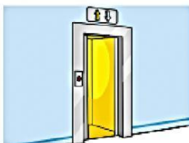
lift / elevator