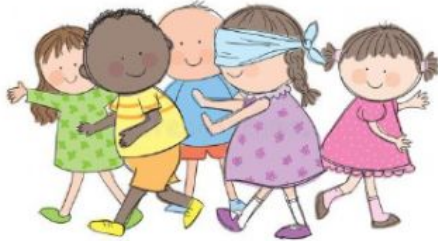
BLIND MAN'S BUFF