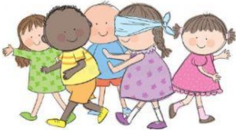
BLIND MAN'S BUFF