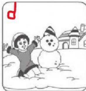
The snowman is ready.