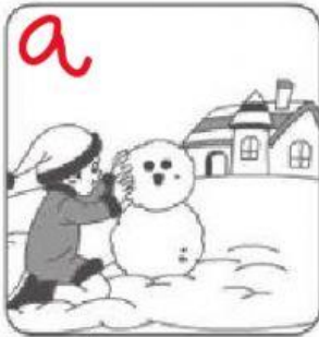
He makes a snowman.

6. Choose the answer to put the events in the correct order.