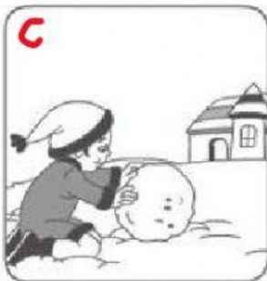
Mac is collecting snow.