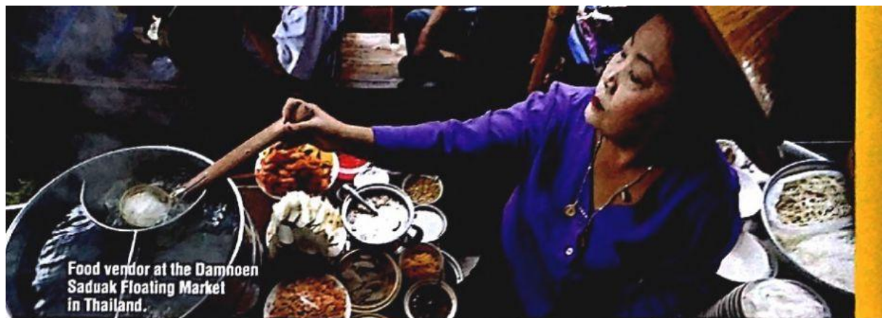
Food vendor at the Damnoen Saduak Floating Market in Thailand.