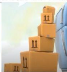
3- ORMIE PILES UP BOXES.