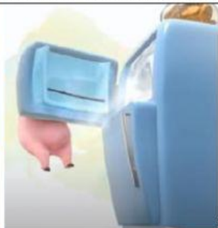
2- ORMIE OPENS THE FRIDGE DOOR.