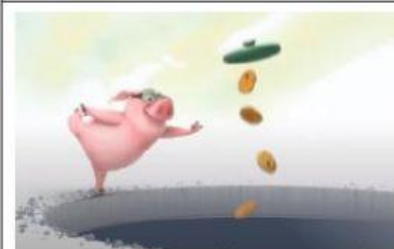
E- THE FRIDGE FALLS IN THE HOLE.