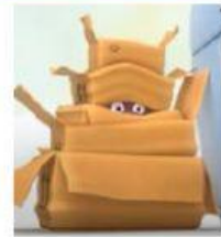
A- HE FALLS IN THE BOXES.