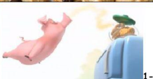
1- ORMIE SMELLS THE BISCUITS.