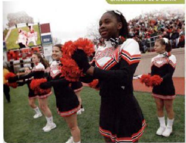
Cheerleaders at a Game

Cheerleading isn't easy. You have to be good at dance and gymnastics.