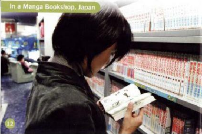
In a Manga Bookshop, Japan

Manga is a type of comic book. In manga there are words and pictures to tell a story or give information. There are lots of different types of manga, for example, adventure, mystery, science fiction, and comedy. There is manga for all ages.