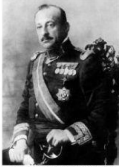
a. IEMLGU MRIPO ED AIRERV

Extra→ Unscramble the names of these important figures of Modern Spain and write them under their pictures.