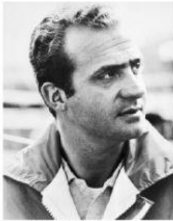
b. ANJU ASRLOC I