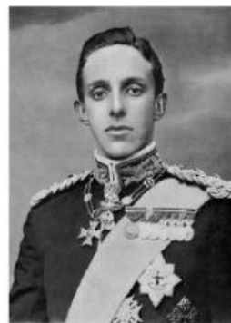
f. ANOSFOL IIXI