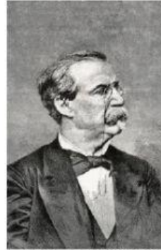
d. TONOIAN ONCASÁV LED ITLASOLC