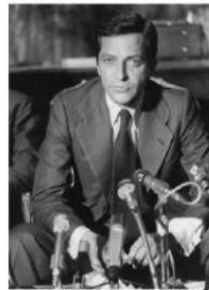
e. DFOOAL SEARUZ