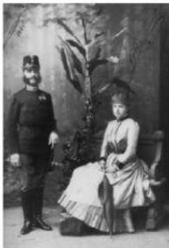
c. AOSLFNO XII