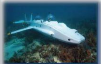
A submarine exploring the ocean