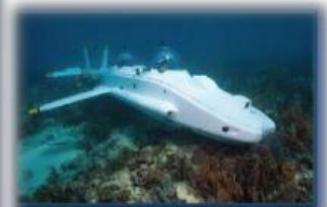
A submarine exploring the ocean