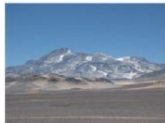
Ojos del Salado mountain