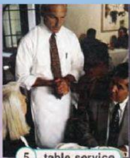
5 table service