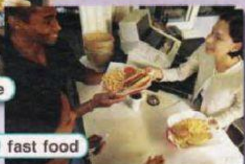
3 fast food