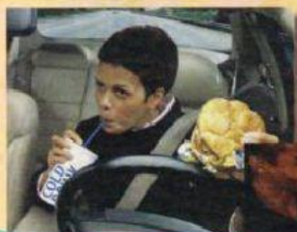
2 drive-through service