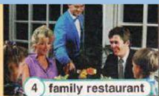
4 family restaurant