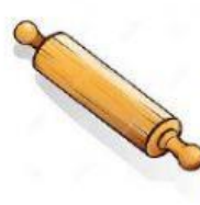
a rolling pin