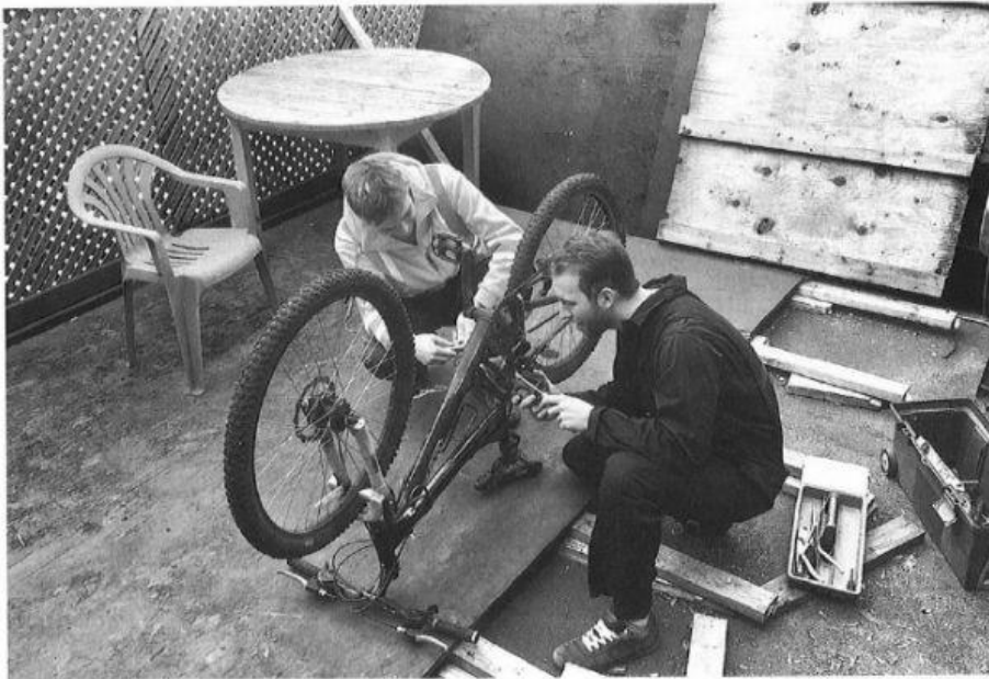
bicycle: xe đạp tool box: hộp dụng cụ