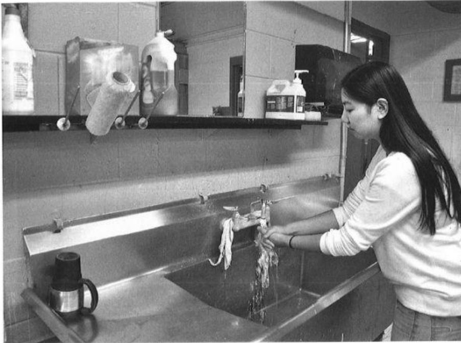
sink: bồn rửa coffee mug: cốc cà phê