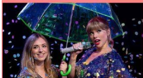
Madame Tussaud's Museum