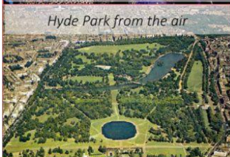
Hyde Park from the air