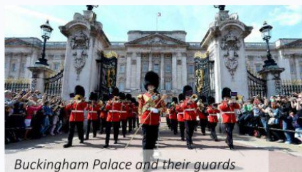
Buckingham Palace and their guards

You can't forget about Buckingham Palace , where the Queen and the Royal Family live. Changing the Guard is a formal ceremony in which the group of guards protecting Buckingham Palace are replaced by a new group of soldiers. The ceremony is free to watch and many people from around the world meet outside the palace to see it.