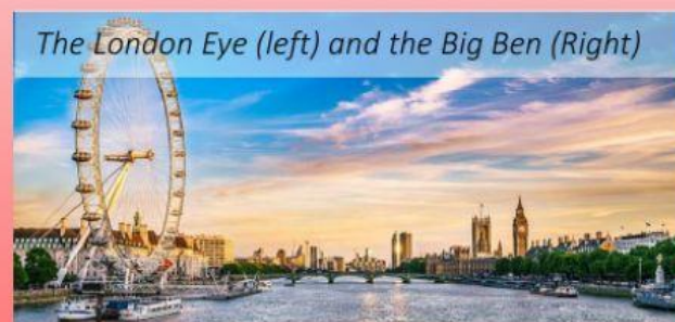
The London Eye (left) and the Big Ben (Right)