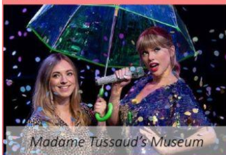
Madame Tussaud's Museum