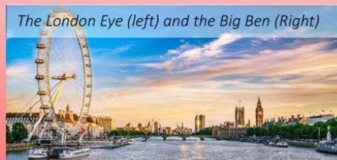
The London Eye (left) and the Big Ben (Right)