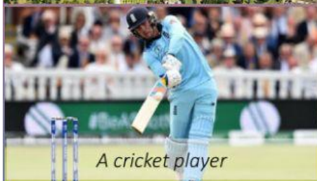
A cricket player

Another iconic place is Piccadilly Circus , it is the most famous road intersections in the world. It's iconic for different reasons: the unique architecture, the iconic advertisements that adorn the buildings, the statue of Eros in the middle and the variety of shops you can see there.