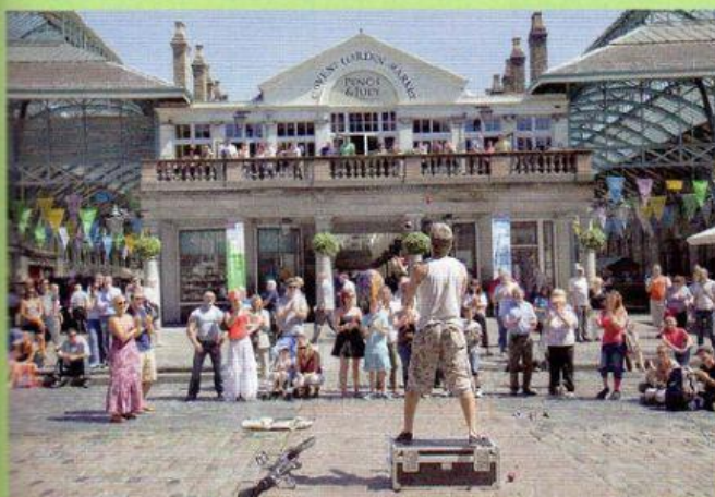
3. Covent Garden

In this museum, tourists can see models of famous people like One Direction, Barack Obama and Lady Gaga.