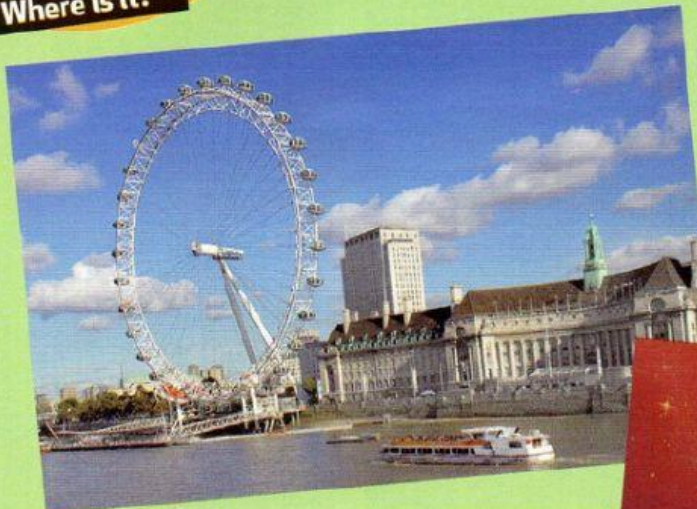
1. London Eye

Londoners always take their friends to this place. A lot of Harry Potter fans take a picture here! It's very funny!