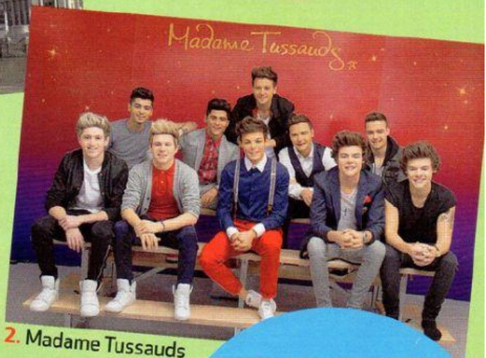
2. Madame Tussauds