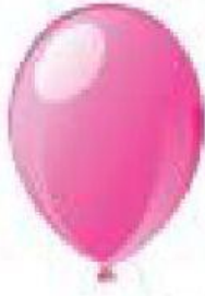
Air (inside the balloon)

Draw a line to match the objects and their correct state of matter.