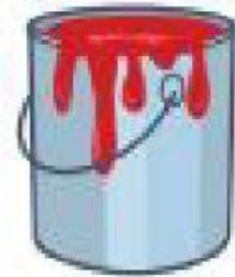
Paint (inside the can)