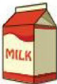
Milk (inside the carton)