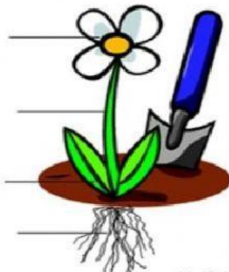
Label the Parts of a Plant