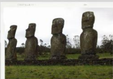
Rapa Nui National Park