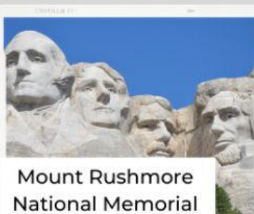
Mount Rushmore National Memorial