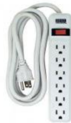
OUTLET POWER STRIP