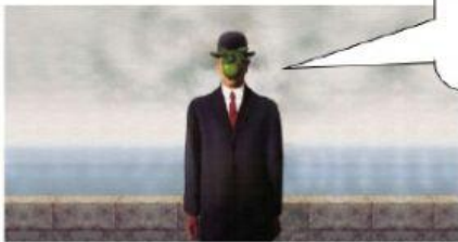
The Son of Man, painted by Rene Magrittees

I can't see you very well. My painter is crazy.