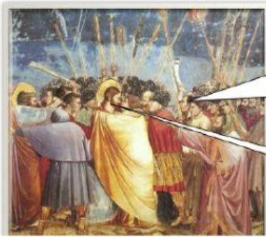
The Kiss of Judas ,painted by Giotto