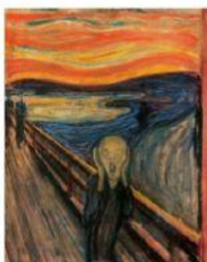
The Scream , painted by Edvard Munch