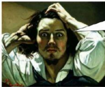
Le Desespere, painted by Gustave Courbet

I can't see you very well. My painter is crazy.