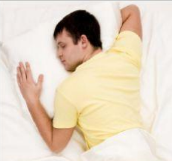
right to sleep