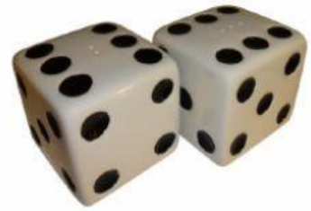
by rolling dice