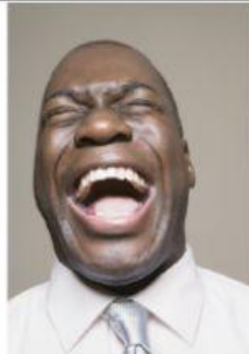
right to tell jokes