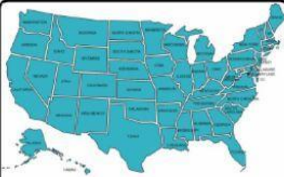
A majority of the states must vote for it