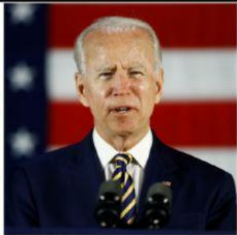
The President orders it