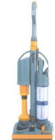
the vacuum cleaner