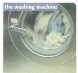
the washing machine