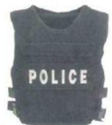
the bullet-proof vest