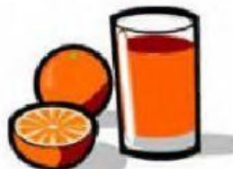
A glass of orange juice