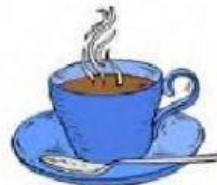
A cup of coffee