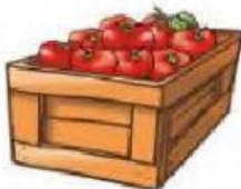
A crate of tomatoes