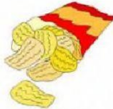
A bag of chips