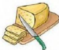
A slice of cheese