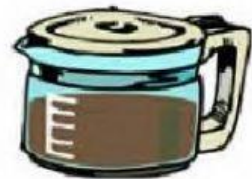
A pot of coffee