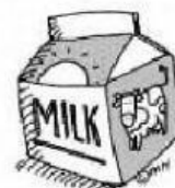
A carton of milk