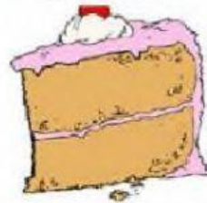
A piece of cake