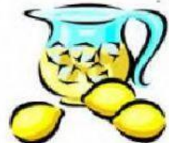
A jug of lemonade