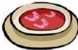
A bowl of soup