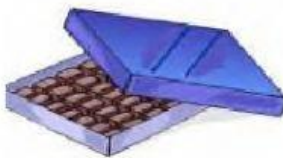
A box of chocolates