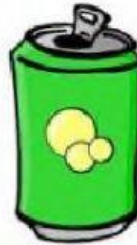
A can of pop