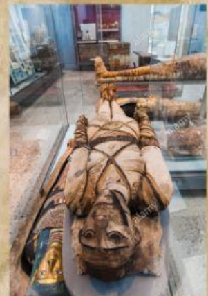
Mummies from Ancient Egypt