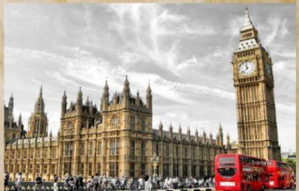
'The Big Ben and the Houses of Parliament'.

Big Ben weighs about the size of two large African Elephants and it has a diameter of 7,5 metres. 'The Houses of Parliament' has got about 1100 rooms and 5 km. of corridors. The most important places are: "Lords' Chamber" and "Commons' Chamber".