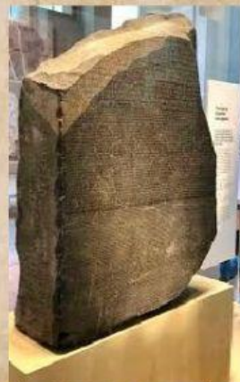
The 'Rosseta Stone'

The British Museum opened in 1759. It was the first museum in the world to be open. It has nearly six million visitors a year. It has important collections about the most important civilisations in the world: ancient Egypt, Greek, Rome... There, you can see the 'Rosseta Stone', that permitted to understand hieroglyphics.