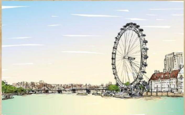
'London Eye' next to the river Thames.

To celebrate the end of the 20th century, in London was built "The Millennium Wheel" or "London Eye". It's a Ferris wheel next to the river Thames with amazing views of London. It is 135 metres high. At the present it is the Europe's tallest Ferris Wheel, and now it is one of the most popular tourist attractions in Britain. More than 3,5 million people visit it every year.