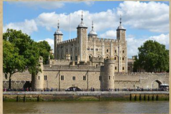
'The Tower of London'.

.- Over the Thames, next to the Tower, you can see 'The Tower Bridge'.