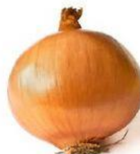
One onion 1.00