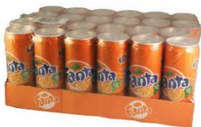
Case of soda 10.00