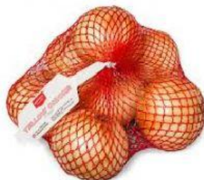
3 pounds of onions 4.00