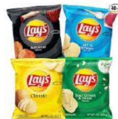
4 bags of chips 4.00