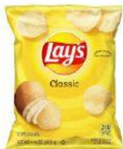
One bag of chips 1.00