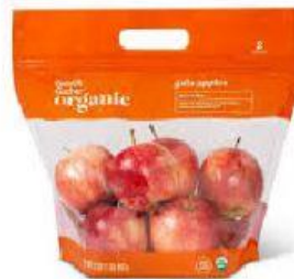
Bag of Apples 5.00