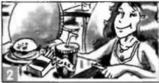
2 often / eat fast food for lunch