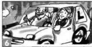
6 have a driving lesson / twice a week