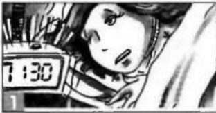
1 every day / get up / at half past seven

A Look at the pictures of Helen and use the prompts to write sentences. Use the correct form of the present simple.