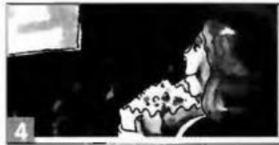
4 once a week / watch a film at the cinema