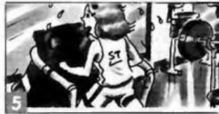
5 rarely / go to the gym