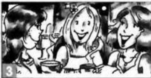
3 in the evening / usually / meet her friends for coffee