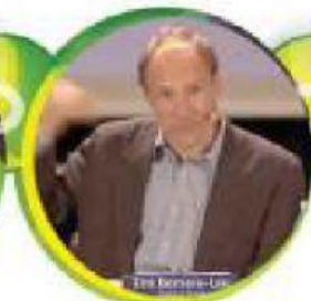
World Wide Web 1989, Switzerland