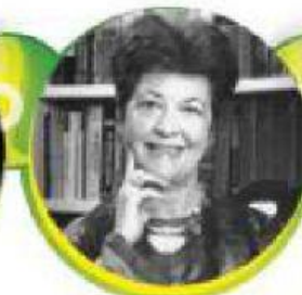
liquid paper 1956, USA