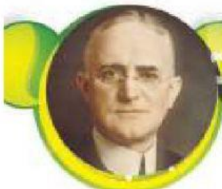
camera 1888, USA