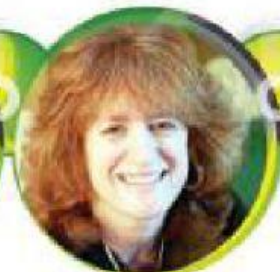
disposable cell-phone 1999, USA