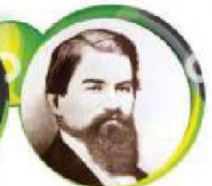
Coca-Cola 1886, USA