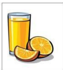
a _____ of orange juice