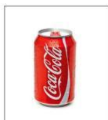
a _____ of cola

Complete the sentences with much , many , some , any , a lot of , little .