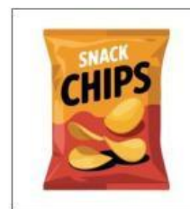
a _____ of snacks