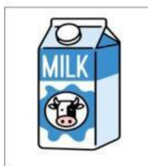
a _____ of milk