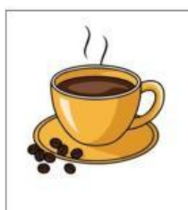
a _____ of coffee