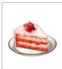
a _____ of cake