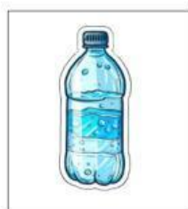
a _____ of water