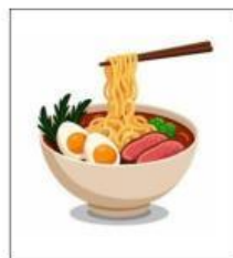
a _____ of noodles