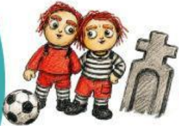
Stars and Stripes