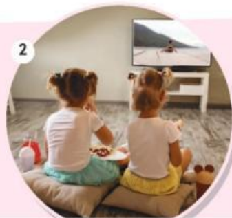
(The girls/TV/every day)