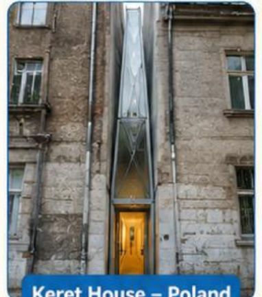
Keret House - Poland