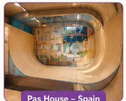
Pas House - Spain