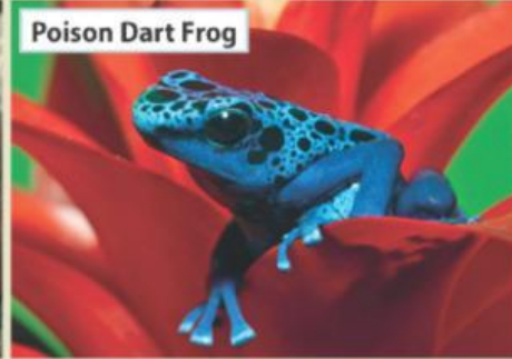
Poison Dart Frog